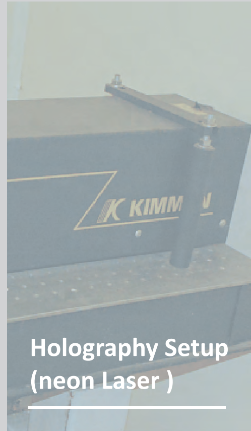
Holography Setup (neon Laser )